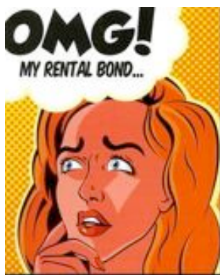
Poster for the new Rental Deposit Authority

The Tenants' Union is also concerned that contact with the RDA may be a struggle for people with English language difficulties and has called for extra resources to help tenants with the transition to the new system.